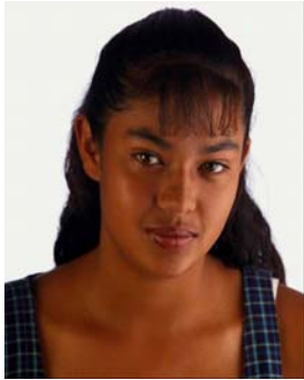
Learn about your rights and responsibilities as a taxpayer

Our workshops cover a variety of topics, including Earned Income Credit, Child Tax Credit, employee/independent contractor status, taxpayer's rights and responsibilities,