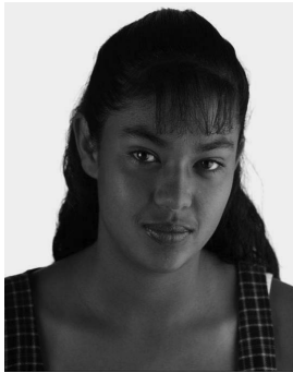
Learn about your rights and responsibilities as a taxpayer

Our workshops cover a variety of topics, including Earned Income Credit, Child Tax Credit, employee/independent contractor status, taxpayer's rights and responsibilities,